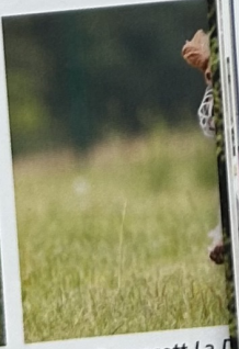
Ravensett La D... the lure at