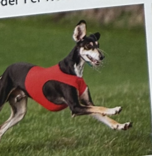
Ch Qazal Sarbaz Har Kala Rachi at West Ilsley.